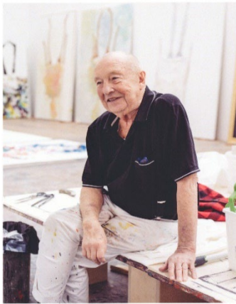
Georg Baselitz, Atelier am Ammersee, 2021